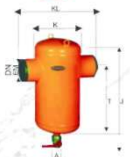
Welded/Flange Technical Details Of Connection.