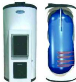
ELECTRICAL HOT WATER HEATER